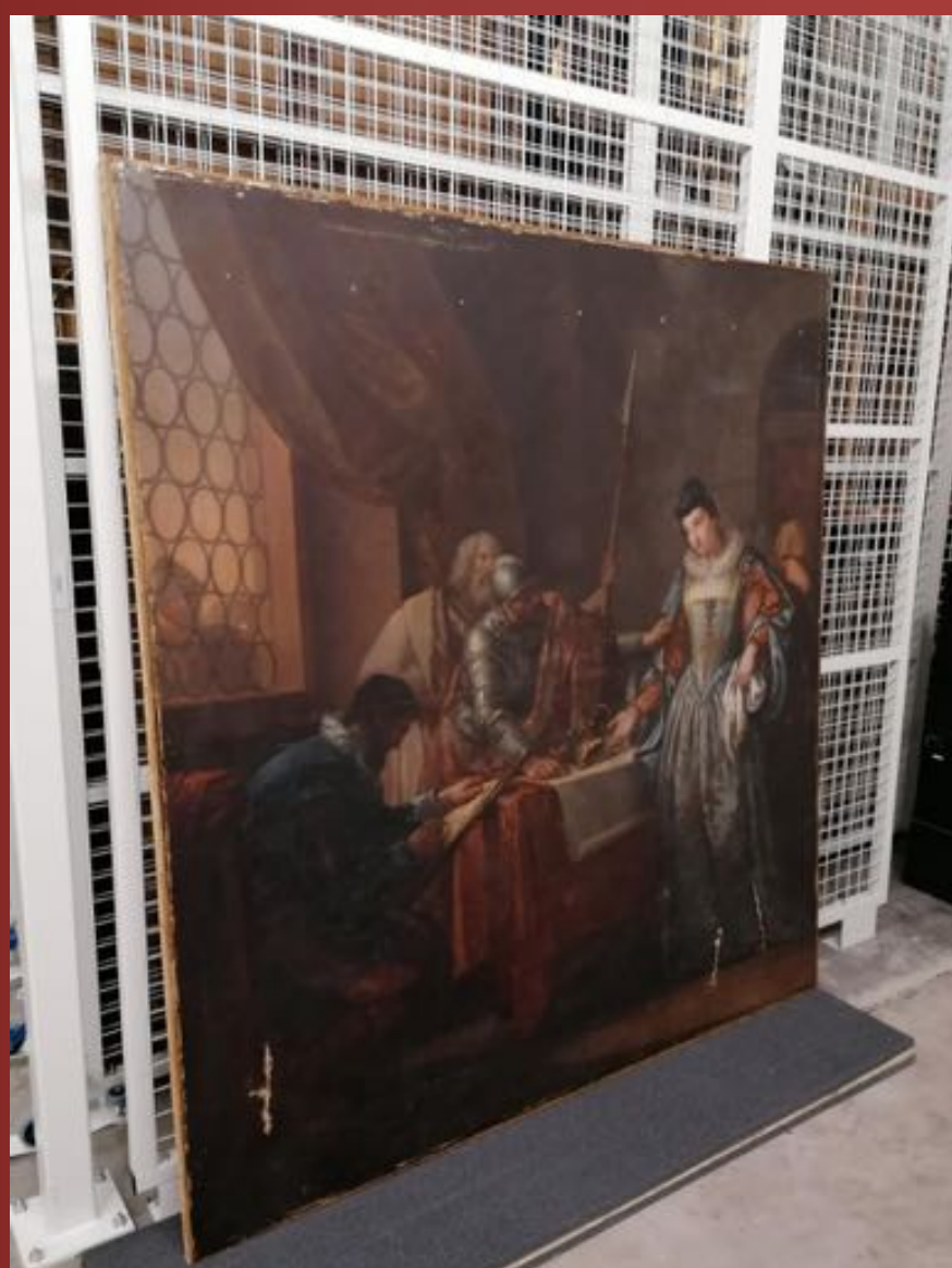
Viewing The Abdication of Mary, Queen of Scots (GLAHA:43874), Gavin Hamilton, 1765-1775.

This placement supplements a wider research project exploring the posthumous representations of Mary, Queen of Scots. The Abdication of Mary, Queen of Scots was commissioned by James Boswell, Lord of Auchinleck, when he met painter Gavin Hamilton in 1765. It is a crucial moment in the timeline of Marian objects, as this is the first known instance of an artwork that tends toward a romanticised and historical image of the queen. Previous depictions were heavily politicised in the context of Jacobitism.