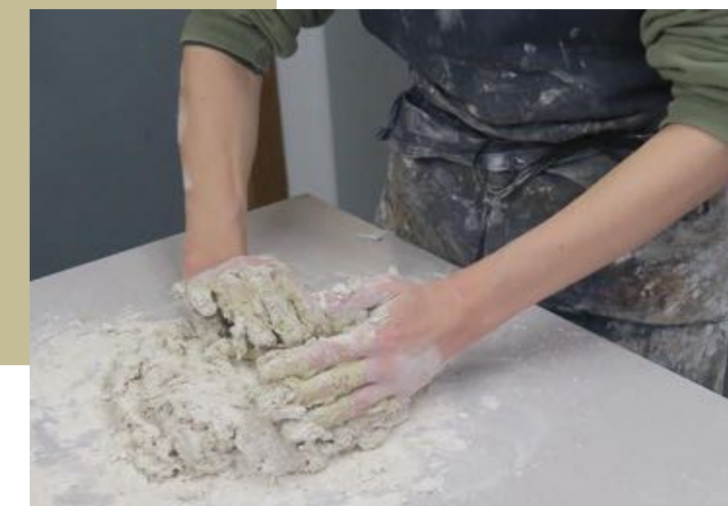
Rolling of the composition after mixing

The mould is then carefully lifted off to reveal the pattern, which is then cut off and lifted using a knife. After application of glue the design is then placed onto the wooden frame and glue is then once more brushed over.