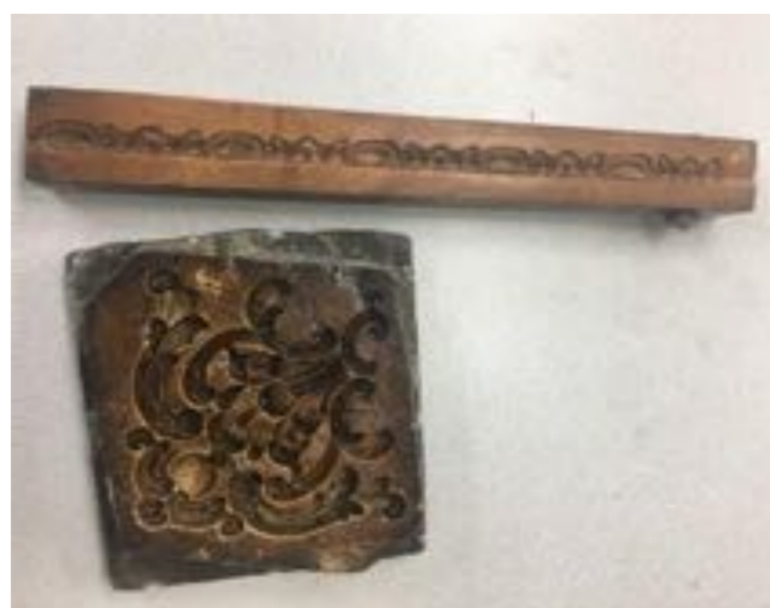
Two specific boxwood moulds used for this reproduction project

Knowledge of these original Scottish frame moulds create positive implications not only toward the promotion of Scottish art, but also toward conservation practices.