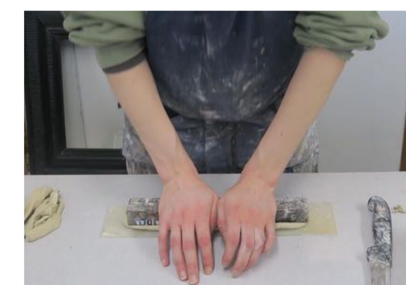
Pressing the mould onto a flat surface