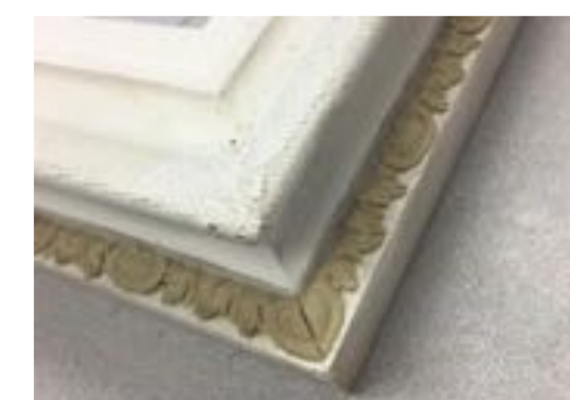
Finished application before painting