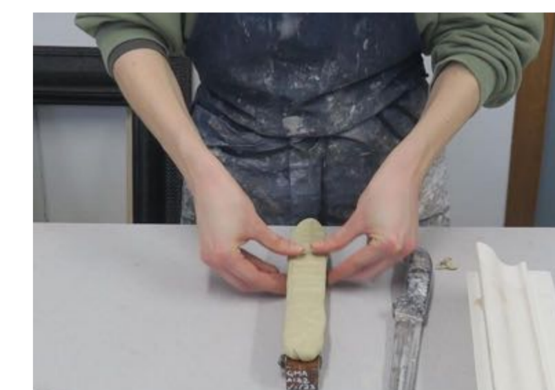
Pressing the composition onto the mould