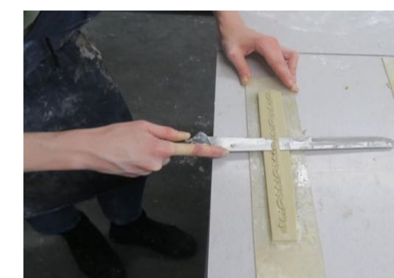
Cutting out the design